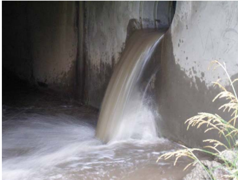
Water is wasted as unfiltered street runoff goes directly into a stream.

Water harvesting from impervious roads and rooftops creates a vegetated filter that protects our water quality, and reduces storm water runoff as well as downstream erosion and sedimentation problems.