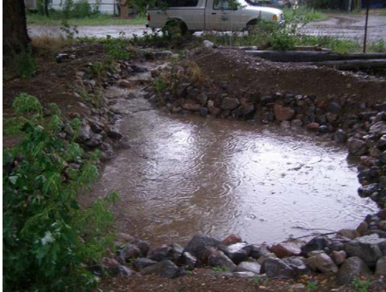
Water harvesting from a city street irrigates the Silva Creek Botanical Gardens, Silver City