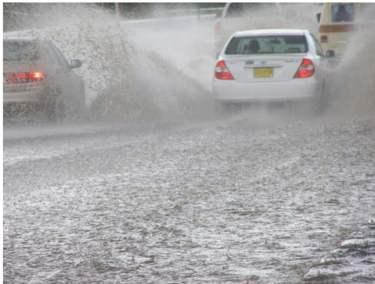
Rainstorm in Bayard, NM August 1, 2010 Stormwater on road is very dangerous.

Municipalities and streets departments will receive a lot of free water harvesting infrastructure along road rights of way, pocket parks, etc. It will be the responsibility of the municipality to maintain this infrastructure. Bear in mind that maintaining water harvesting earth basins and curb cuts is far cheaper than the extra cost of maintaining roads that become rivers or ice floes. Therefore no maintenance costs will be borne by the project budget.