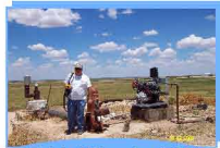
Point of Diversion (POD) Any point (well, diversion dam, etc.) at which water is diverted from its course for use in some beneficial application.