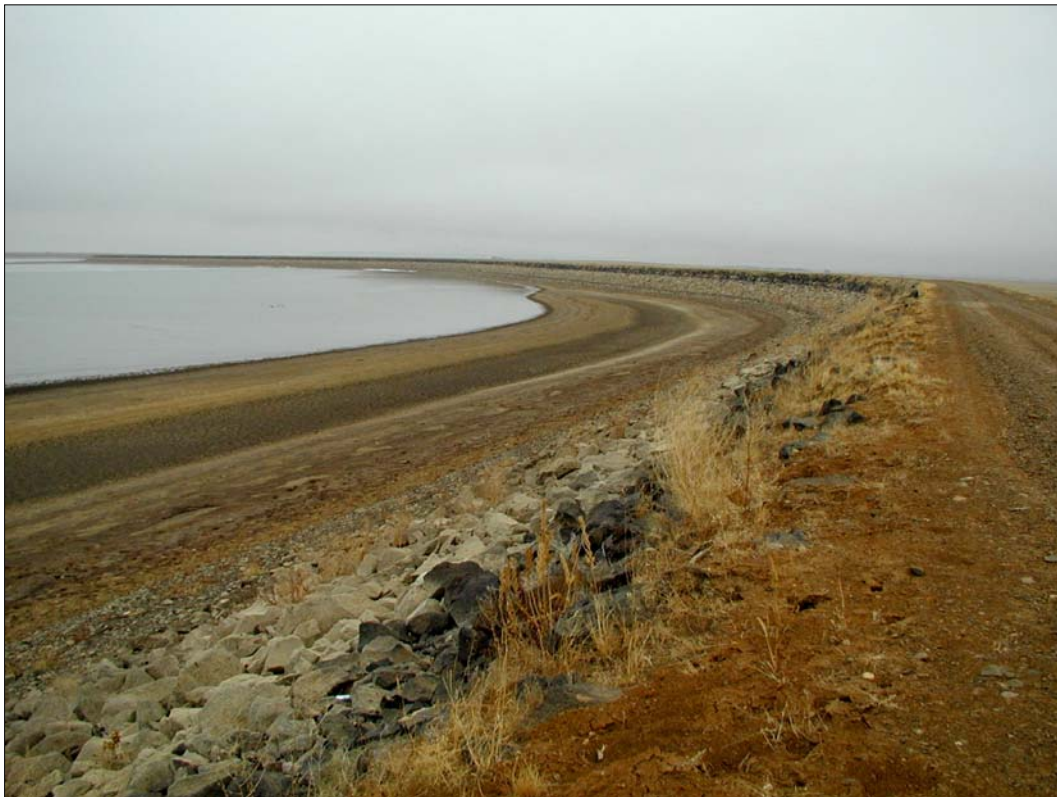
Low lake levels are among the many reminders of the importance of water planning to New Mexico's future prosperity.