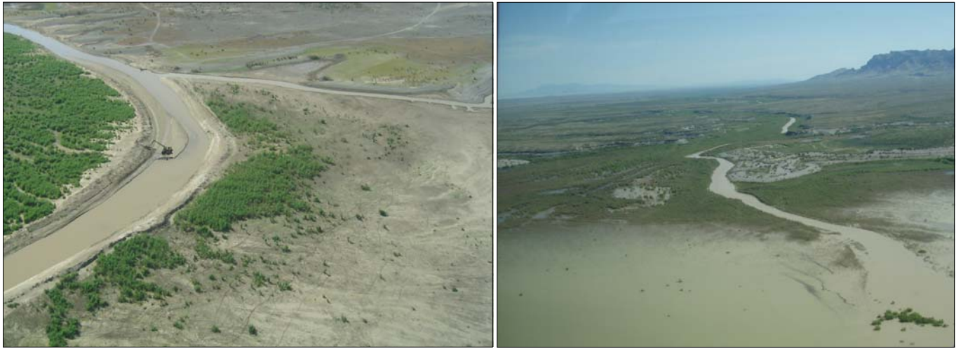
Excavation of the Elephant Butte pilot channel reconnected the Rio Grande with the lowered reservoir pool following several consecutive years of drought.