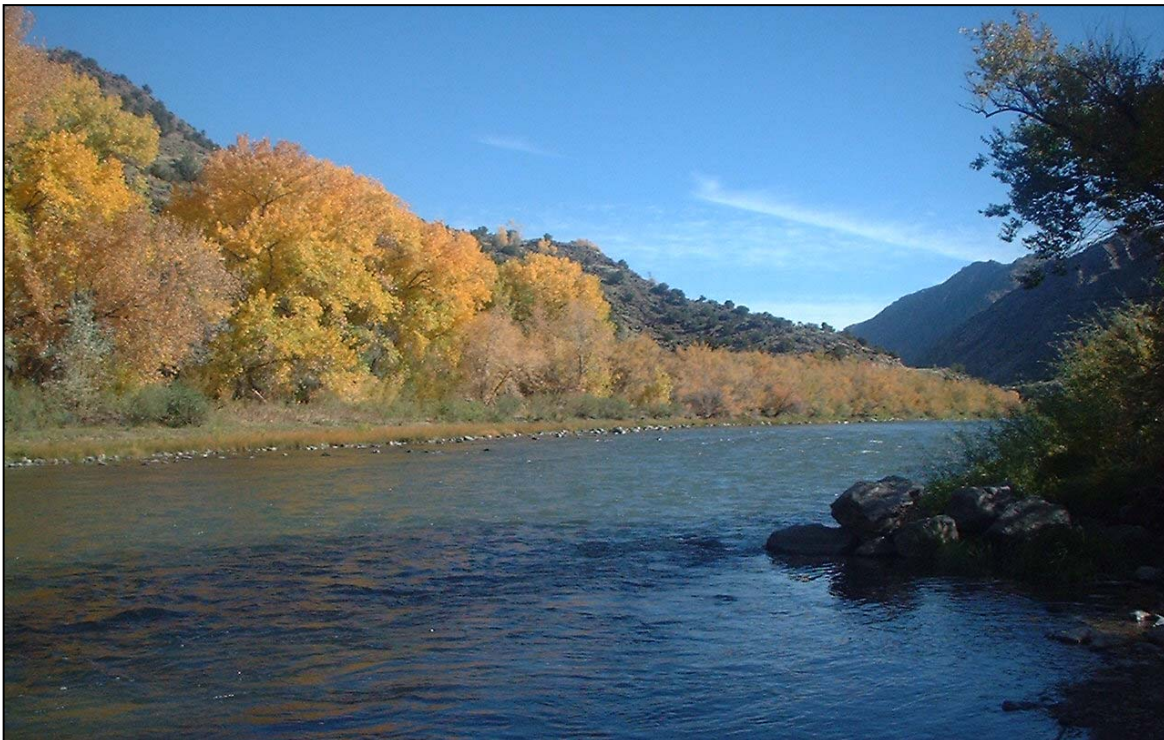
Planning for wise water resource management benefits New Mexicans throughout the state.

Funding for the State Water Plan update will help protect New Mexico's future interstate water allocation through responsible water management. The State Water Planning effort provides a foundation for effective water management that protects water availability and quality, ensures the most efficient use of water, encourages collaboration instead of litigation, and directs funding to water infrastructure improvements of greatest need.