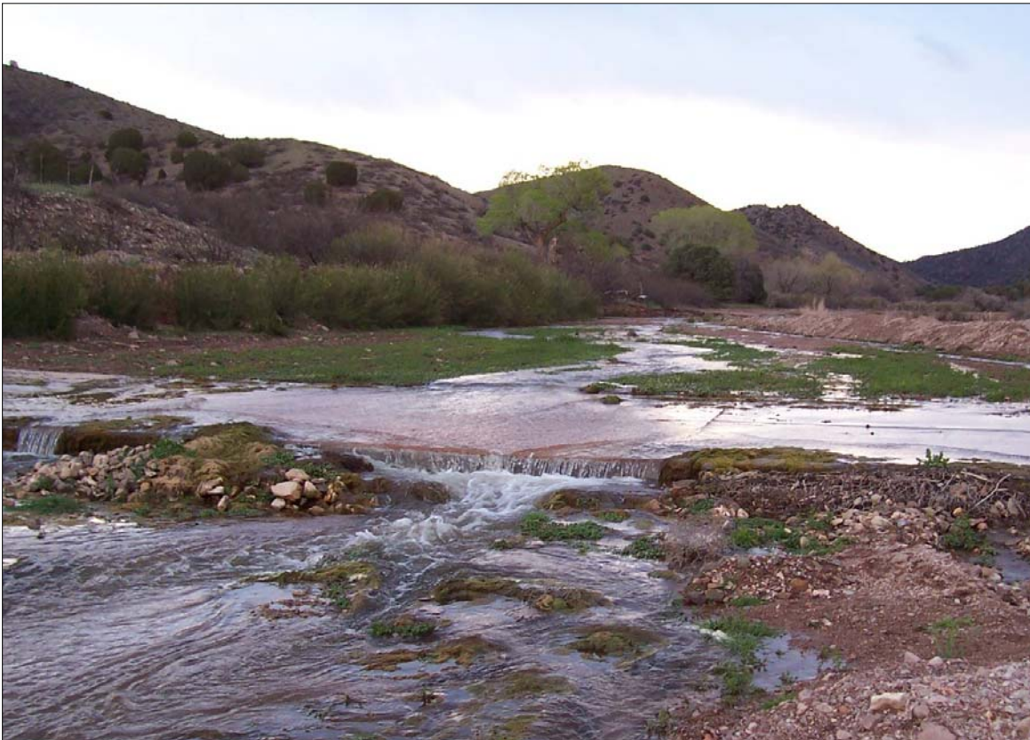
Creek in southwestern New Mexico