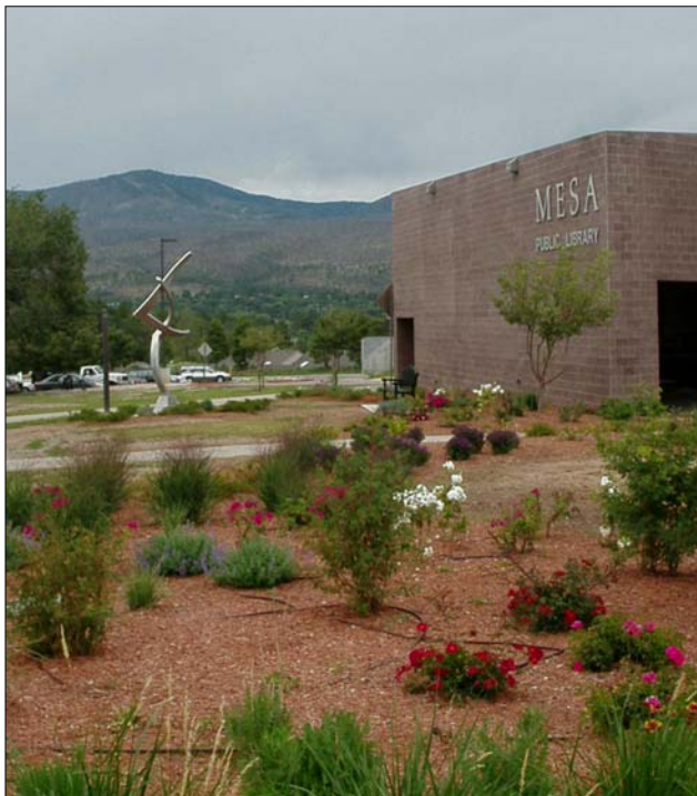
Local governments are encouraging their citizens to conserve water through xeriscaping and other measures.