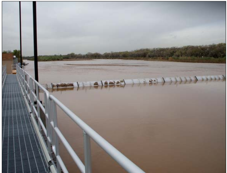
Albuquerque's newly constructed diversion dam will allow the city to tap its San Juan-Chama water for municipal drinking water supply use.