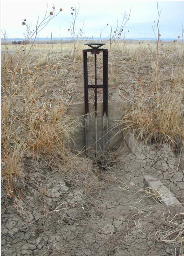
Planning for drought is critical.