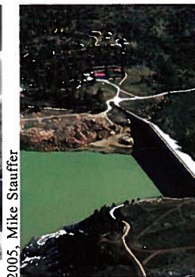
Abiquiu Dam completed

Water Code. In the century that has followed, New Mexico's water history has included the creation of water projects, the establishment of water compacts between New