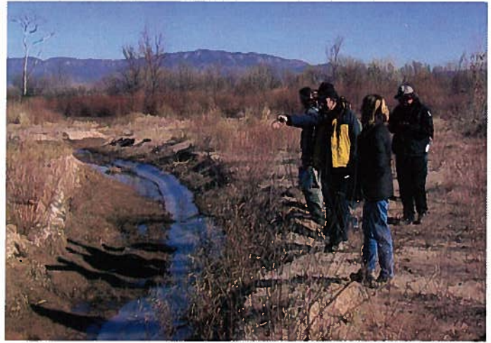
Interstate Stream Commission staff members join with Bureau of Reclamation, City of Albuquerque, and New Mexico Game and Fish employees to view habitat restoration.

phic river feature, intended to create improved habitat to benefit the Rio Grande silvery minnow. The project design included multiple restoration techniques. High flow channels were cut through the point bar to produce additional channel habitat and large shelves were excavated to encourage overbank flooding at lower river stages. Berms were constructed with the excavated materials to encourage sediment redistribution. Native vegetation was planted in an attempt to discour-