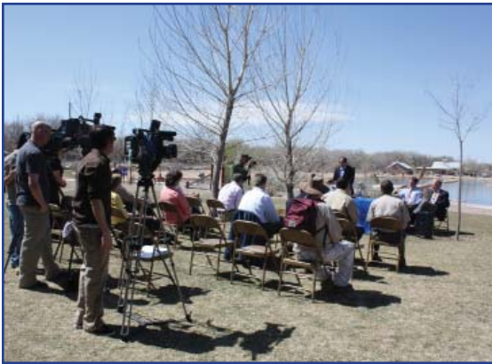
Representatives from three local television stations covered the news about snowpack and spring runoff.

The average to well-above-average snowmelt runoff should help replenish storage reservoirs making it another great season to enjoy water-related recreational activities.