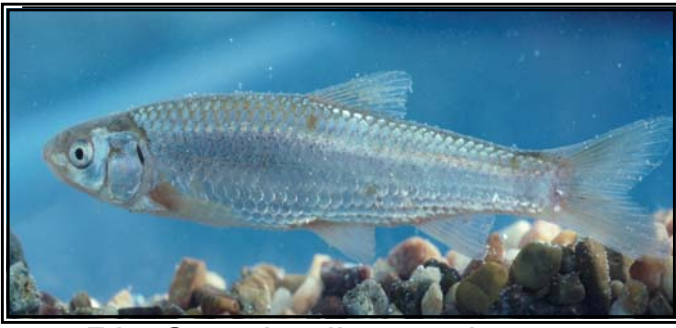
Rio Grande silvery minnow Hybognathus amarus

Historically, the fish was found in 2,400 river miles of the Rio Grande and Pecos River. Today, it is restricted to 174 miles of the Rio Grande from Cochiti Reservoir to the headwaters of Elephant Butte Reservoir. It was listed as endangered in 1994.